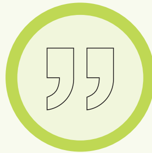
Conventions of language (spelling, grammar and punctuation)